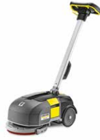
BD 30/4 C BP