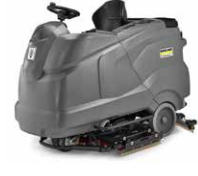
B 200 R BP WITH 2 SIDE BROOMS + R 85