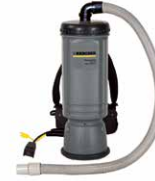
BV 7/1 VAC PAC 6 HEPA