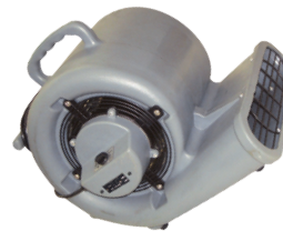
② Aim at 45°

Handle fits conveniently into the bottom of the air mover to stack three units easily and safely.