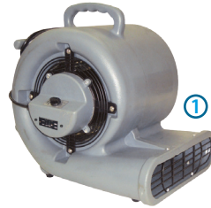
① Aim Flat

Compare us to the competition – discover the difference!