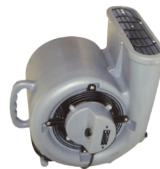
③ Aim at 90°