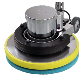
Marble & Stone Model