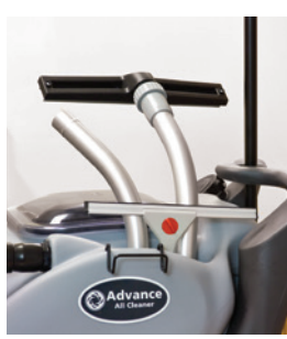
Standard accessories are easily stored on machine.