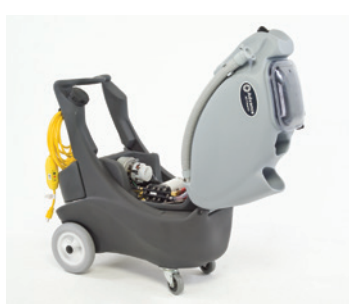
Clam shell design for easy access to the component pallet.