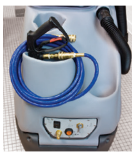
Front storage for pressure washer.