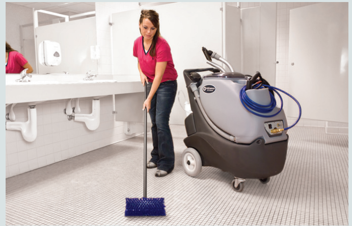
Use the squeegee side to move excess water on floors.