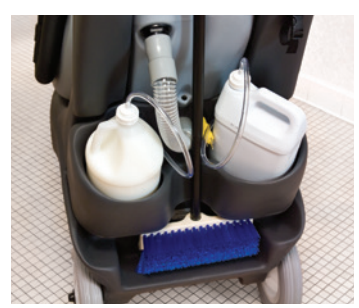
Universal chemical bottle storage.