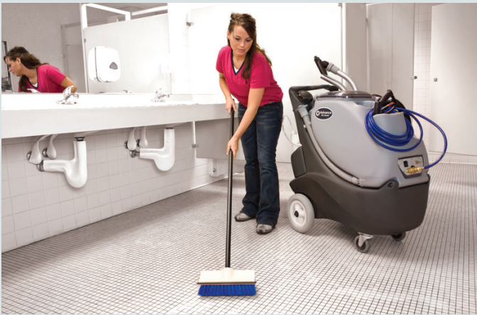
Use the scrub brush to scrub the floor and any other difficult to clean areas.

Advance's All Cleaner XP answers the call for an affordable, touch-less approach to cleaning restrooms and other areas with hard surfaces. You'll improve productivity and see better results – now that's smart cleaning.