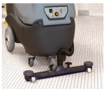
Optional front mount squeegee for easy water pick-up.

Restrooms Locker Rooms Hallways Windows Kitchens Stairwells Carpet Pre-spraying Exercise Facilities