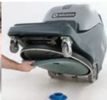
Pad changes are easier with the tip back design of the BU800™.