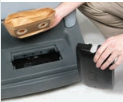
Two port dust bag is easy to access for bag changes.

K-12 Schools Retail Stores and Shopping Centers Colleges and Universities Supermarkets Hospitals and Healthcare Facilities Government Buildings