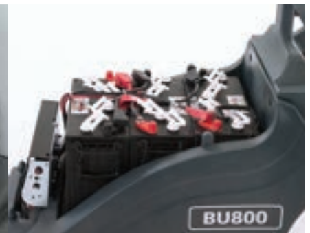
Choose between wet cell or service-free AGM batteries. Onboard charger is standard.