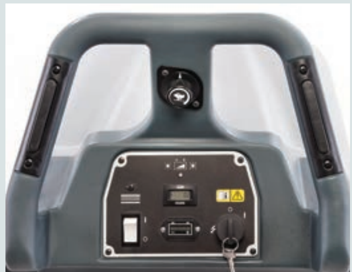
Traction drive model features speed control and reverse button.