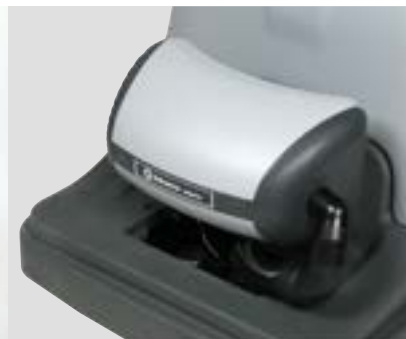
Optional vacuum available for active dust control.