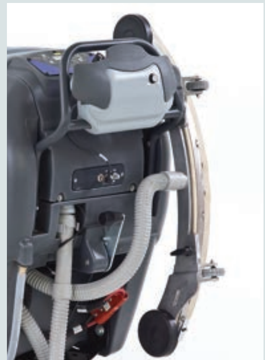
A built-in squeegee hanger makes transport easier and reduces trip and fall accidents.

One-Touch™, integrated scrub pressure and solution flow rate settings: