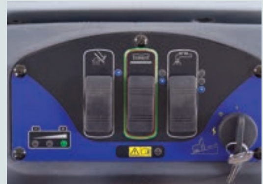
The ST 26 inch disc model – provides simple operation and robust scrubbing controls.

Advance's rugged, low-maintenance SC750™ and SC800™ scrubbers deliver incredible value on a walk-behind platform. High productivity per tankful allows for 84 minutes of continuous scrubbing, which reduces dump/refill cycles and helps provide fast ROI. The optional EcoFlex™ System offers the flexibility to clean across the entire cleaning spectrum from green to clean. At the touch of a button one can switch from chemical free cleaning to using an ultra low dilution ratio, and of course detergent can be used at full strength for the toughest of soils. The burst of power feature lets you easily apply more pressure, more solution and more detergent at the touch of a single button. With the flexibility to easily apply the right scrubbing performance for the job, you'll use less detergent, minimize water use and save on cleaning costs.