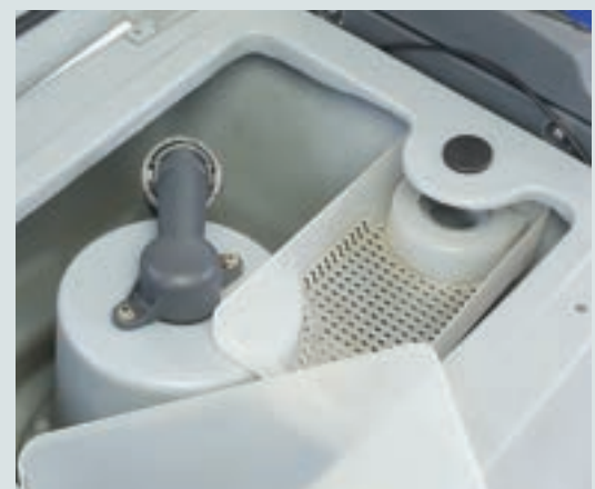
An integrated debris catch cage traps and collects drain clogging debris.

Extreme Scrub For use on extreme soil levels (10% of scrubbing applications)