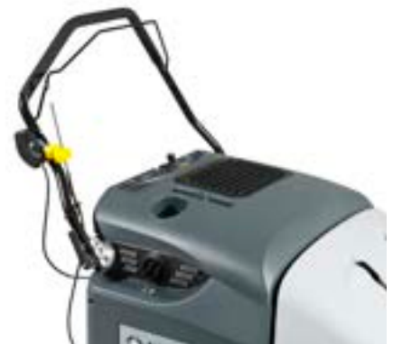
Convenient transport and storage: Handlebar completely foldable.