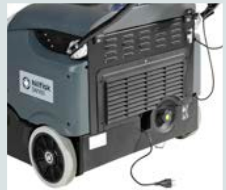
The battery version of Nilfisk SW900, for both in- and outdoor sweeping, has an onboard charger as standard