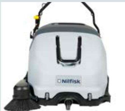
Good hygiene: Hands of user will only touch clean parts of hopper when dumping the debris.