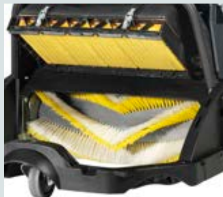
Time-saving maintenance: Broom change, and other maintenance tasks, can be carried out without tools