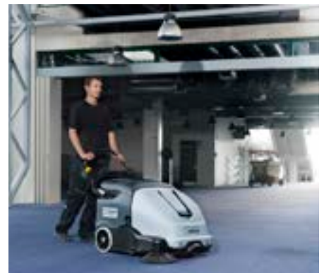
Removes even the smallest particles – also on carpet areas.