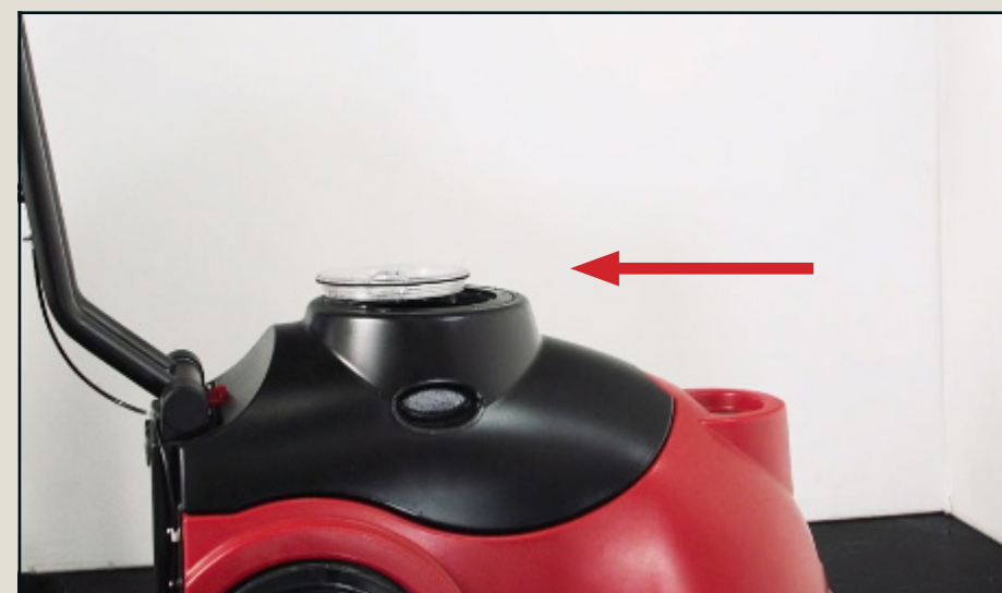
Park the machine leaving the recovery tank cover open