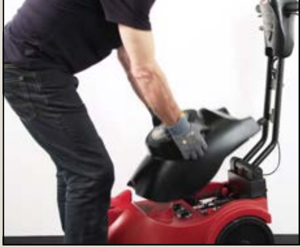
Empty the recovery tank