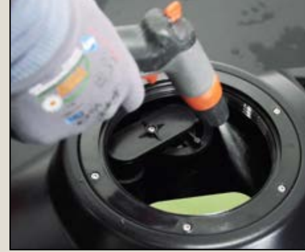
Clean the recovery tank