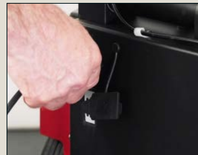
Connect battery charger to socket