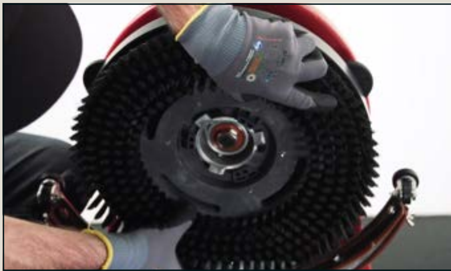
Inspect the brush or pad