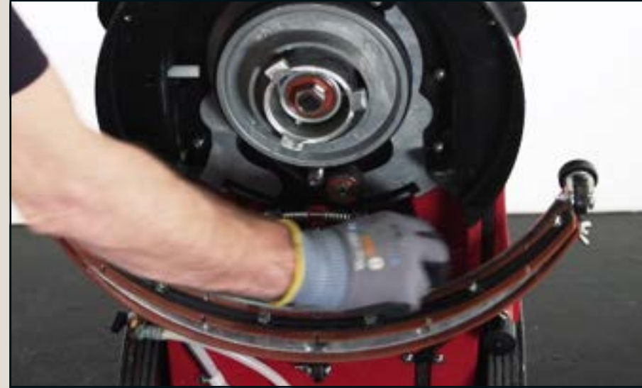
Take the squeegee off, check and clean the blades